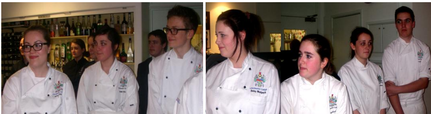
The aspiring student chefs accepted our invitation to 'make an appearance' with the 'front of house' students in the Goodwood Restaurant (see page 4 for more photographs and article)